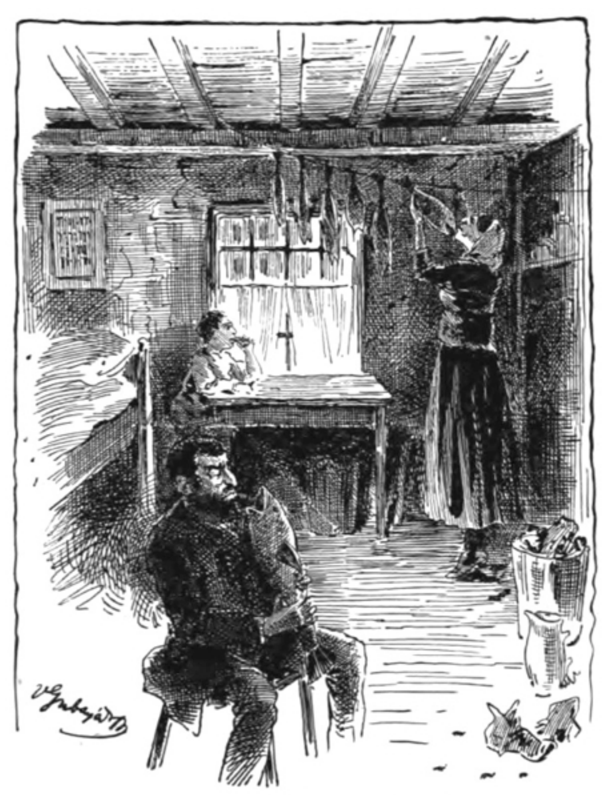
STORING THE STALE FISH OVER NIGHT.