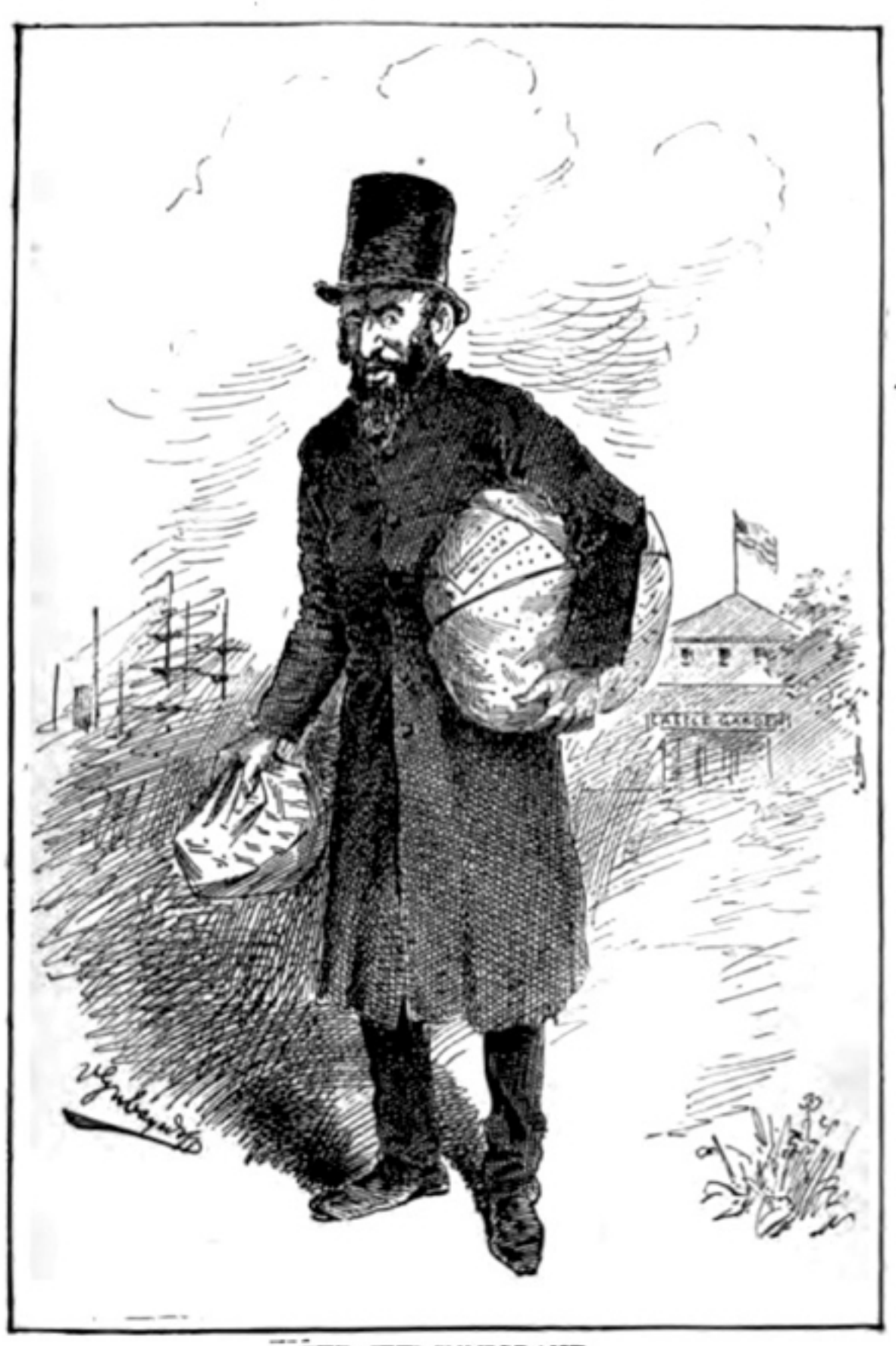
THE JEW IMMIGRANT.