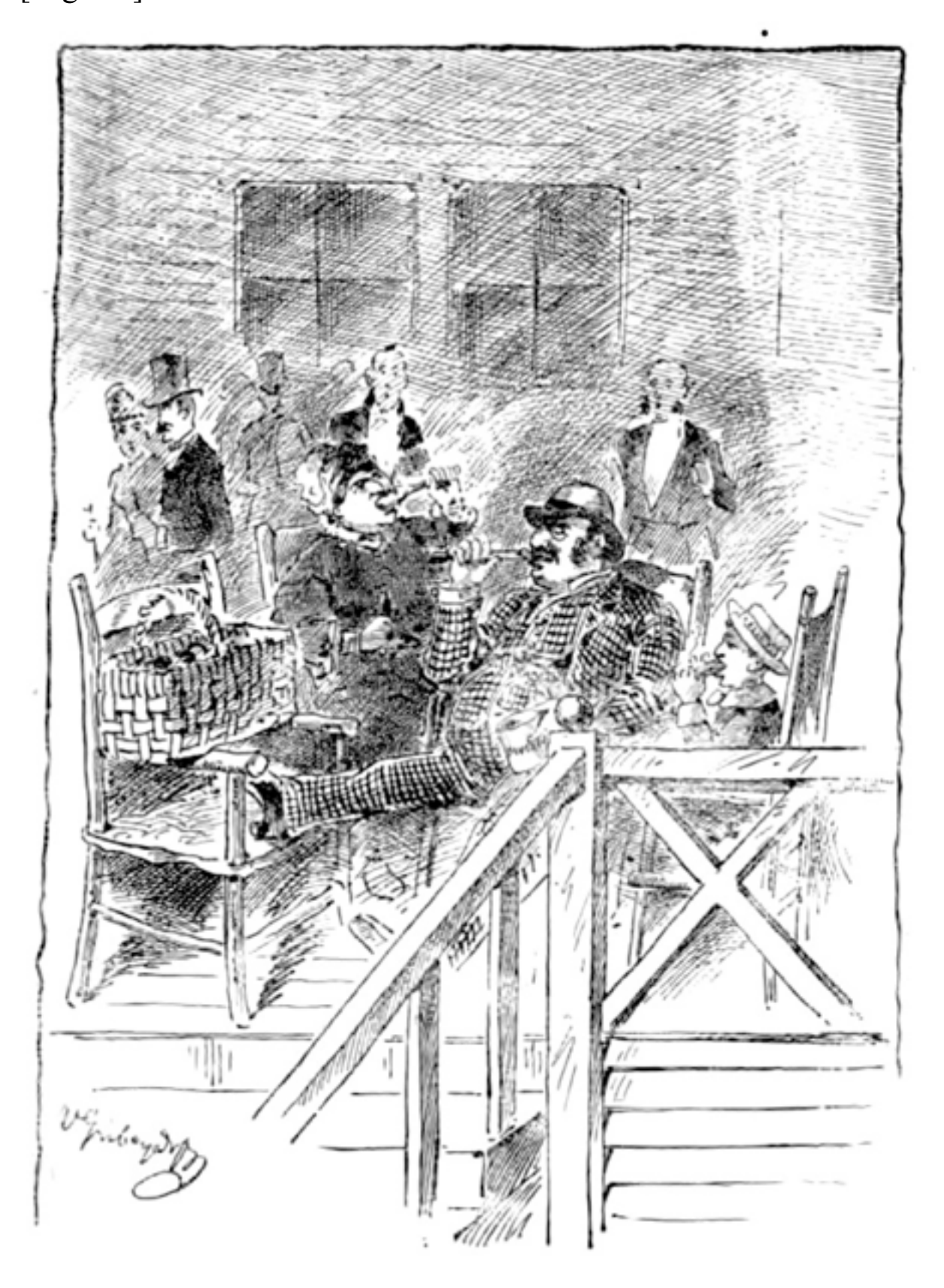
ON THE SUMMER-HOTEL VERANDA.