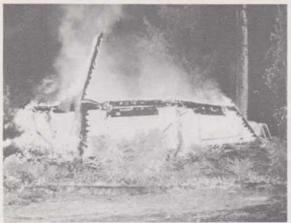
Surrounded by FBI SWAT teams for 36 hours at a remote island hideout in Washington's Puget Sound, Mathews engaged in a fierce machine-gun battle before the authorities burned the house to the ground with Mathews in it.