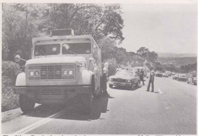
The Silent Brotherhood used a dozen men to stage a $3.8 million robbery of a Brink's Company armored truck in July, 1984. Leaving behind a handgun at the scene of the crime, Mathews inadvertently set the FBI hot on the trail of the gang.