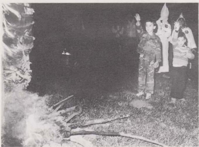
There was no Aryan World Congress held at Pastor Butler's compound in 1985 due to the federal investigation of the Silent Brotherhood following a massive racketeering indictment. But, in July, 1986, the annual event resumed, drawing right-wing activists from across the nation, including Mathews' widow and son. Here, the next generation salutes a burning cross during the Congress.