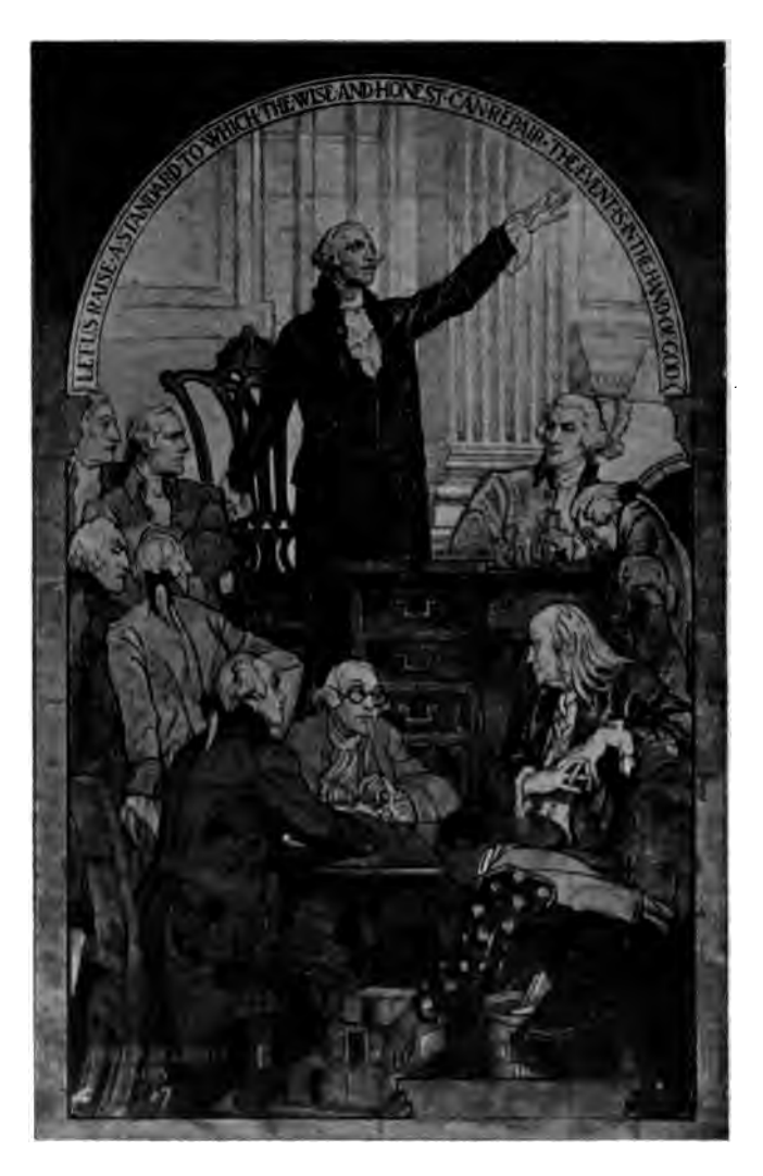
THE CONSTITUTIONAL CONVENTION, PHILADELPHIA, 1787