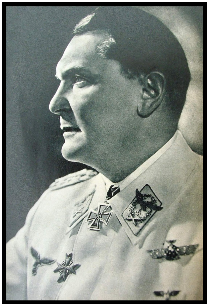
Reichsmarschall Hermann Wilhelm Göring