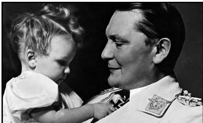
Hermann and Edda Göring