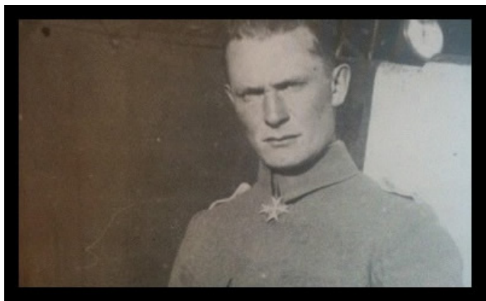
Hermann Göring during First World War