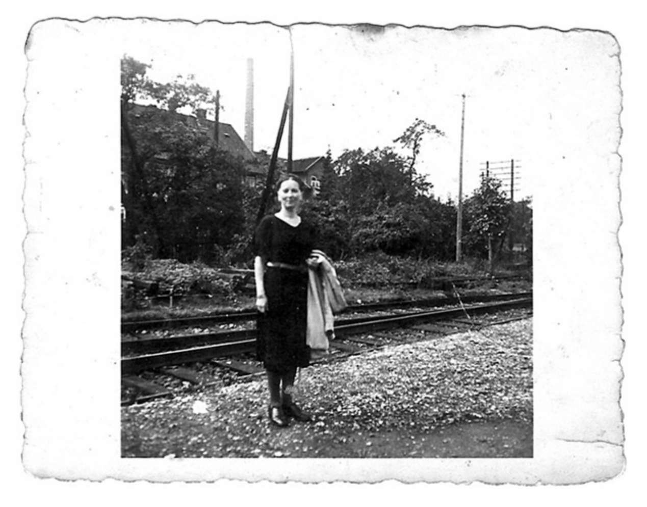
Savitri in Alfeld an der Leine, Lower Saxony, 5 December 1948