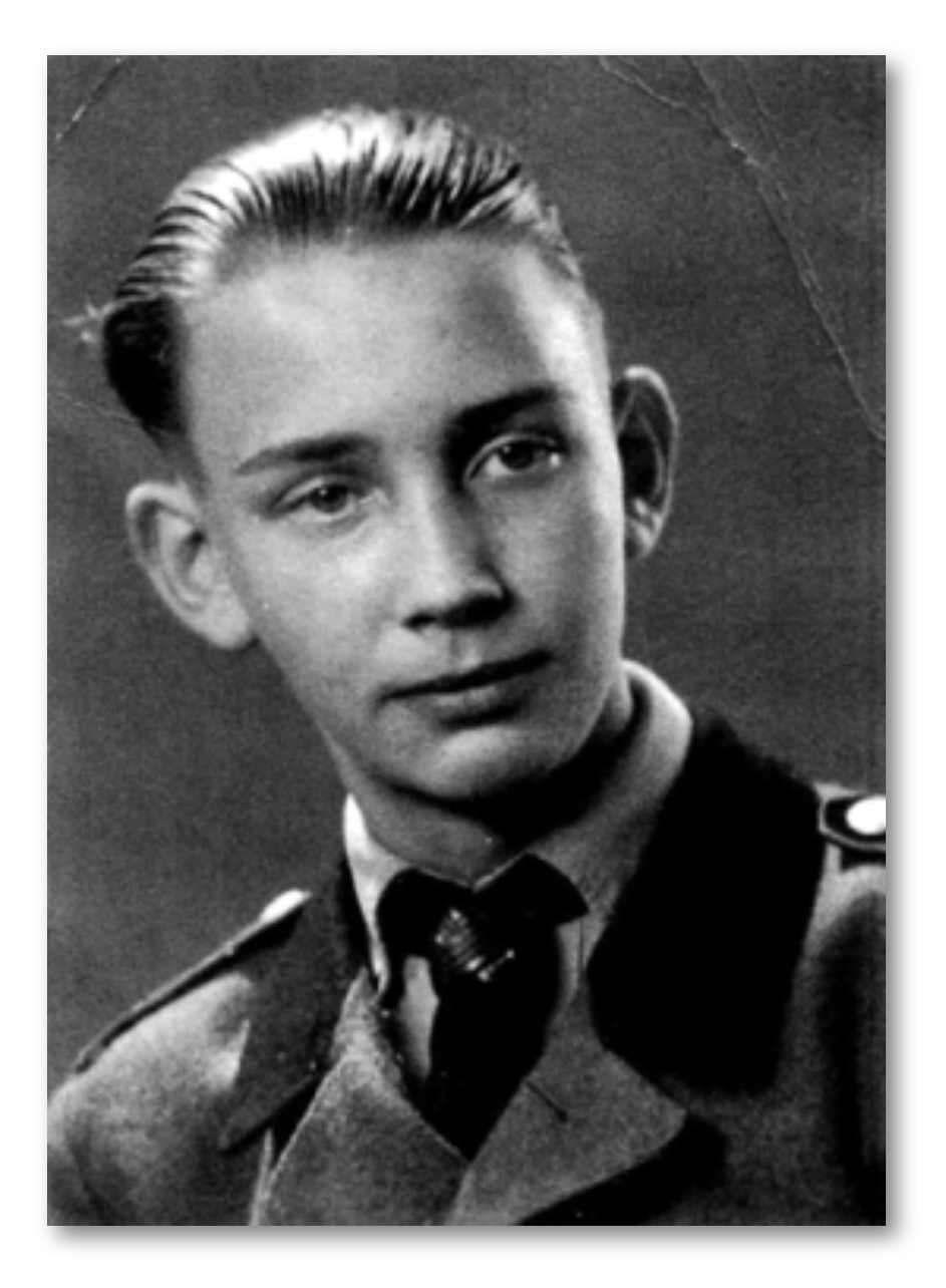
[Image] Myself, about 1942 or 1943 in the Firefighters' Hitler Youth . This unit was organized so that we were able to assist regular fire fighters after air raids. The uniform would be a rarity today, it was made of good material of undetermined origin (possibly from French army stocks) of a brownish color with a black collar. Due to the fine manufacture of these uniforms, for which we did not have to pay, they were better suited to impress the girls than to fight British incendiary bombs. I do not know what eventually happened to mine.

fatherland. Every effort was made to strengthen our minds and bodies. Contrary to what is said today, we were encouraged to become free in spirit, and not to succumb to peer (or authority) pressure. In peacetime, NO military training was allowed by the Hitler Youth leadership; scouting yes. Incidentally, to " snitch on our parents " was frowned upon.