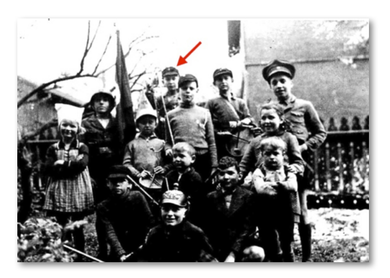
[Image] Our service in the Hitler Youth did not take all of our time, as seen from this picture of 1938. We had invited playmates form the neighborhood to play soldiers. Note the real weapons from our attic. Two guns were old flintlock rifles.

Frequently I am asked about gun control during the Hitler era. Claims are made that Hitler could take power because he disarmed the German people. That is nonsense. In Germany gun ownership was never as prevalent as it is in America. I would say that for hundreds of years one needed a gun license in order to keep a weapon.