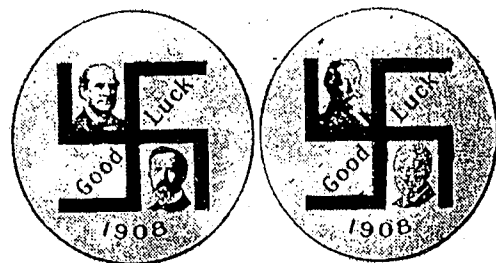
Swastikas symbolized good luck in 1908 presidential election between William Howard Taft and William Jennings Bryan.

The straight line, the circle, the cross and the triangle are simple and easily made forms which may have been invented and reinvented in every age of primitive man. The swastika, however, is a very ancient symbol