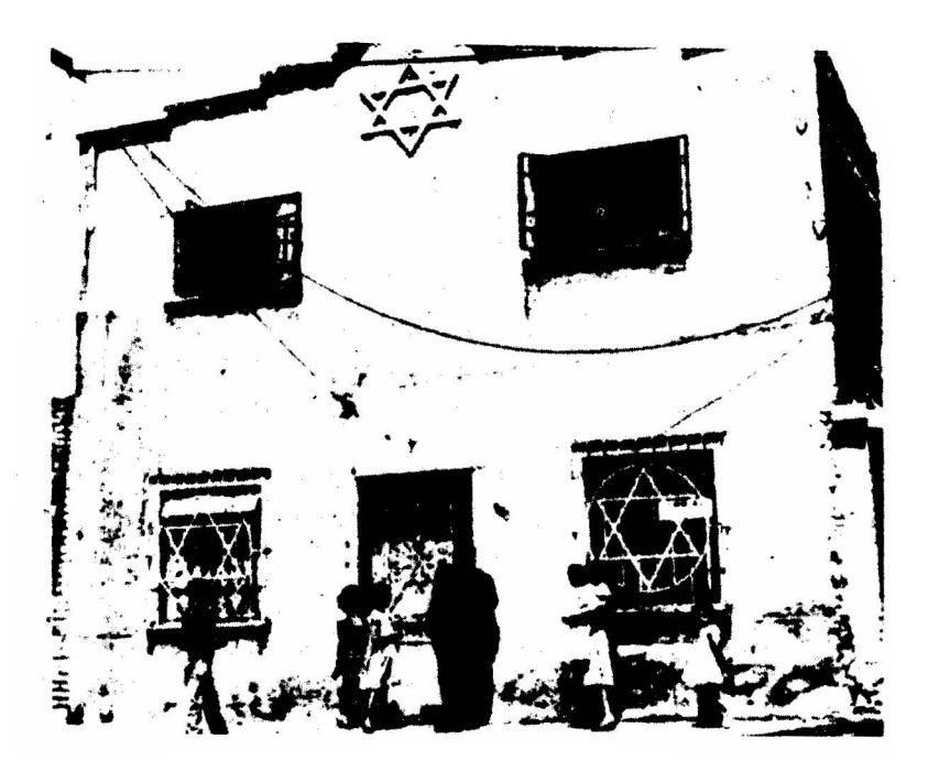
MEXICAN JEWISH INDIANS

The mixture of Spanish marranos, or Spanish clandestine Jews, with the native race of America in the colonies of the old Spanish empire, brought as a consequence the birth of a new Jewish stock, with great mixture of Indian blood. These marranos in many cases appear as Indians with very dark skin, so nobody can distinguish them from the true Indians or hybrids of the Latin American countries. They use Christian names and genuinely Spanish last names and most of them profess the Catholic religion in public, being Jews only in secret. Nevertheless, a small number of them have left the mask of Catholicism to practice Judaism in public. This picture shows the public synagogue in the village of Venta Prieta, located near Mexico City, with some JEWISH INDIANS of the poor class outside it.