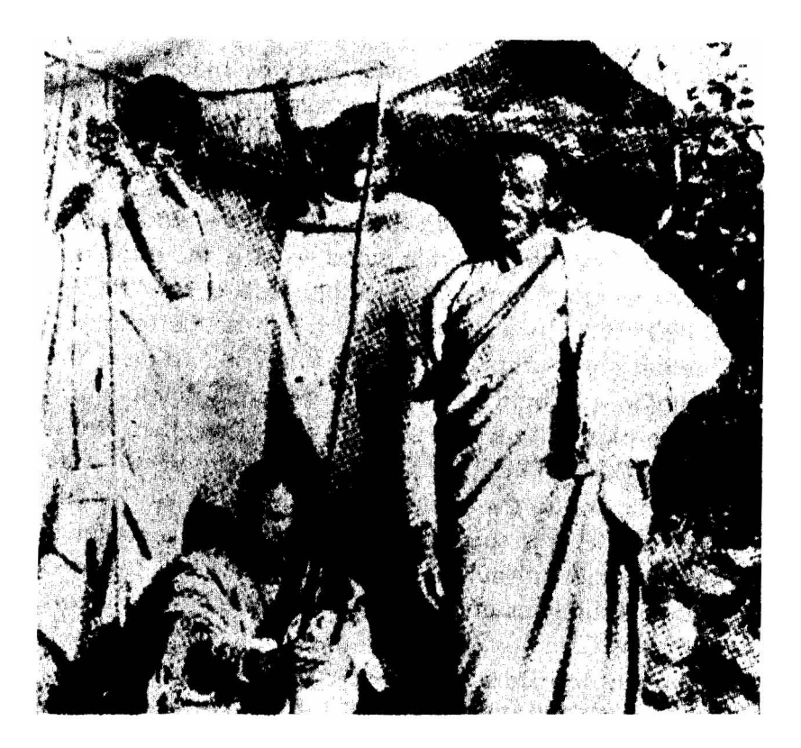
BLACK JEWISH FALASHA PEASANTS NEAR GONDAR

They walk barefoot. Rabbis, religious and political leaders of the Synagogue's Brotherhoods, to avoid that the very poor Jews of all the world become envious of the very rich Jews and millionaires, preach them that ISRAEL'S GOD GAVE THEM POVERTY AS A BLESSING, BECAUSE WITH THAT POVERTY THEY WILL BE BETTER LEADERS OF THE GENTILE PROLETARIAT, WITH WHICH SOCIALIST REVOLUTION, ISRAEL WILL OBTAIN THE TOTALITARIAN AND AB-SOLUTE DOMAIN ON ALL NATIONS. They give them Lenin's example and also those of Jews of the poor class that could conquer the former Russian empire and become its absolute masters.