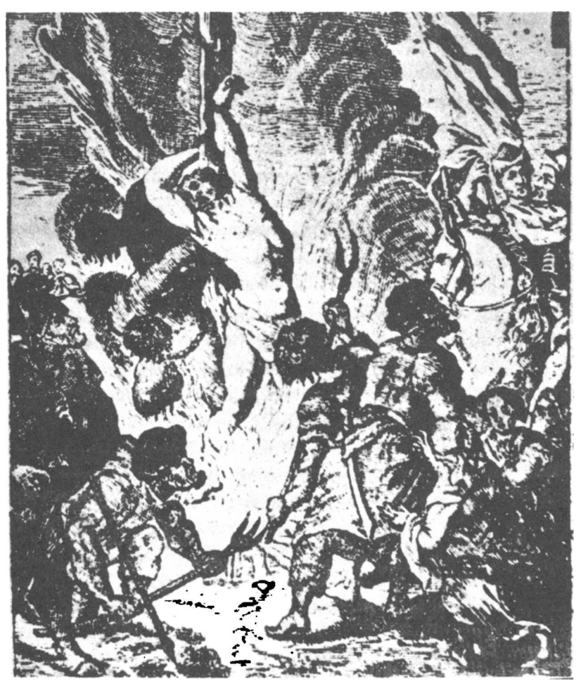
CLANDESTINE JEWS BURNED ALIVE BY THE PONTIFICAL MEDIEVAL INQUISITION.

They were Christians in public and Jews in secret. They were condemned for going to Mass and take communion as Christians, and keep the wafers taking them out of the mouth to profane them. 1370.