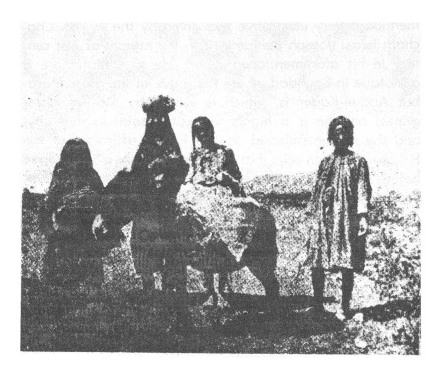
NEEDY JEWS OF YEMEN.

From a peasant town near Sanaa. Judaism uses the needy worker and peasant Jews of Yemen as of other countries, to lead the Marxist revolutions.