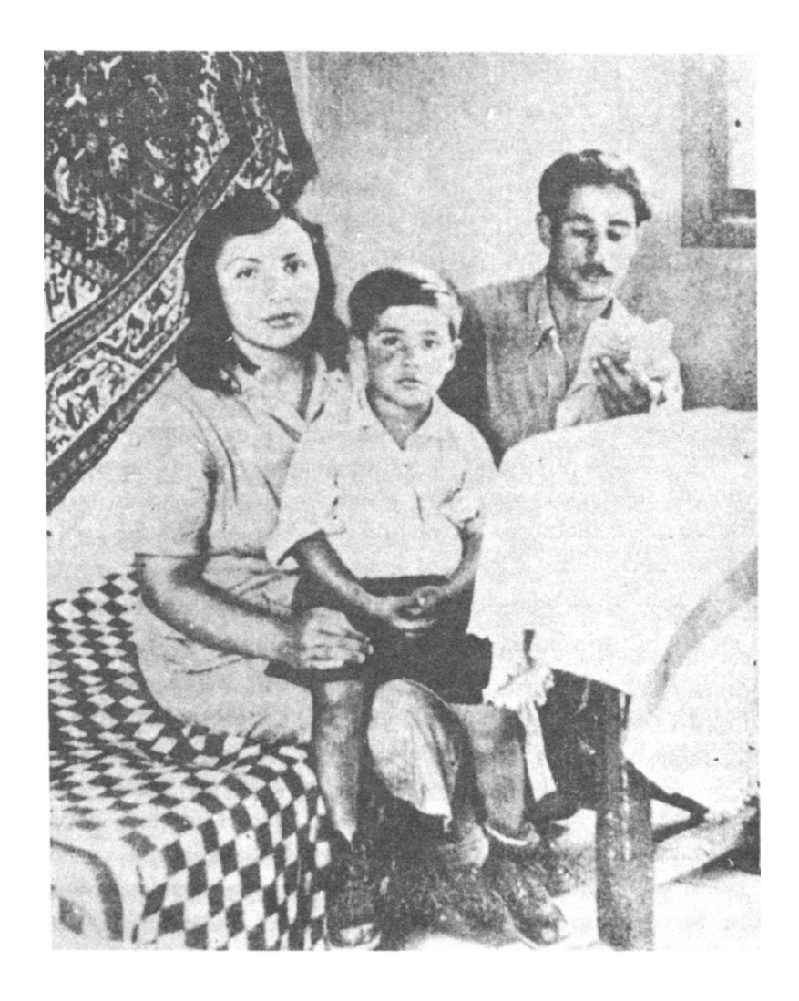
MARRANO FAMILY; THIS IS TO SAY CLANDESTINE JEWS, OF IRAN. THEY ARE PIOUS MOSLEMS IN PUBLIC AND JEWS IN SECRET.

Photo taken from the Great Jewish work titled: "Castilian Jewish Encyclopedia". Additional volume titled "Contemporary Judaism". Mexico, D. F. 1961. Word: Marrano. p. 878, 1st. col. MODERN MARRANISM.