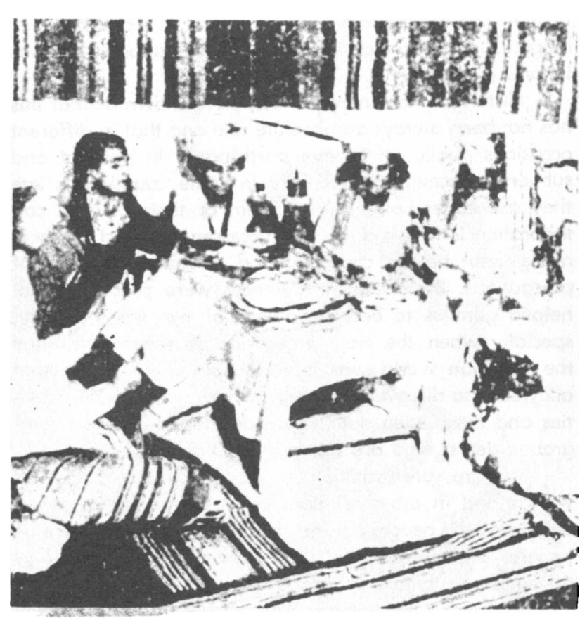
RITUAL FAMILY BANQUET OF YEMEN JEWS OF THE MIDDLE CLASS.

Solemn ceremonies and rites have given and continue to give Judaism a great internal strength. They are of a synagogue or familiar character, according to if they are performed in the bosom of the Synagogue Fraternities or in the family. Ceremonies use to end with a Ritual Banquet in which every plate and every meal has a symbolic meaning. Masonic Banquets — like everything in Masonry — are mere copies of those celebrated in the secret of Judaism. For the gentiles to know about these RITUAL BANQUETS the Jewish books call them DINNER PARTIES, to hide the real meaning in Judaism.