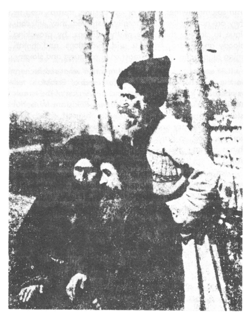
JEWISH TYPES FROM CAUCASUS.

Jewish authors say that the cradle of the Caucasic Hebrews was in Aturpakatan, called Soviet Azerbaidjan today. They have spread into Georgia — Stalin's homeland — Turkey and especially in the Caucasus. Many of them are Moslem in public and Jews in secret, in Turkey.