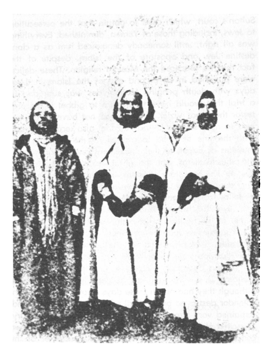
BERBER JEWS OF MOROCCO.

Photo taken of the great Jewish work titled: "Castilian Jewish Encyclopedia" 7th vol. Mexico, D. F. 1950. Word: Morocco, p. 302, 2nd. col.