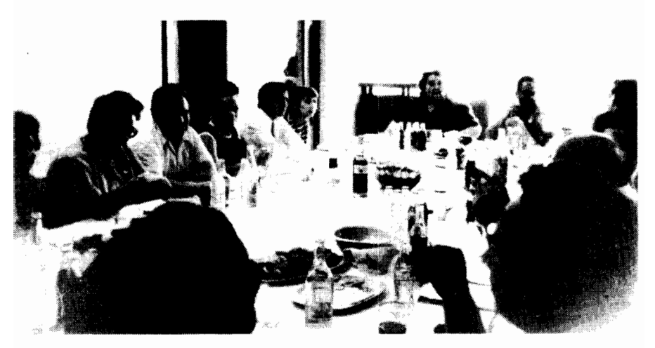
Novosti personnel of the USSR embassy in India at their favourite passtime - boozing.

standing." I knew a number of junior colleagues, who though realizing the sinister nature of Novosti, still hoped that after obtaining some power they would "change the system from within." These people had a tough time preserving their ideals, integrity and sanity. Many made the painful transition from high idealism to deep cynicism. Only a negligible minority of "true comrades" could stubbornly believe in the possibility of "socialism with a human face." These would not advance: the Party does not need such dedicated idiots in its higher ranks. I do not remember an instance of an honest man atop Novosti. What I do remember is the fact commonly known in Moscow, that Novosti perhaps holds first place in the number of mentally ill, alcoholics, sadists, masochists, schizoids, graphomaniacs, etc., and is something of an asylum for all sorts of mental cases never reported to the Serbski Institute — that is, as long as they continue to pretend to be loyal to the Power. And these are the cadres who "decide all" in the business of ideological warfare against the rest of the world.