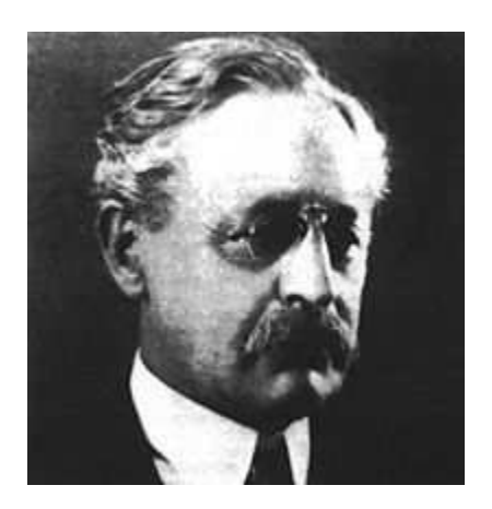
Halford J. Mackinder

decades Russia, based on that area, was in a most advantageous position to expand its power.<sup>4</sup>