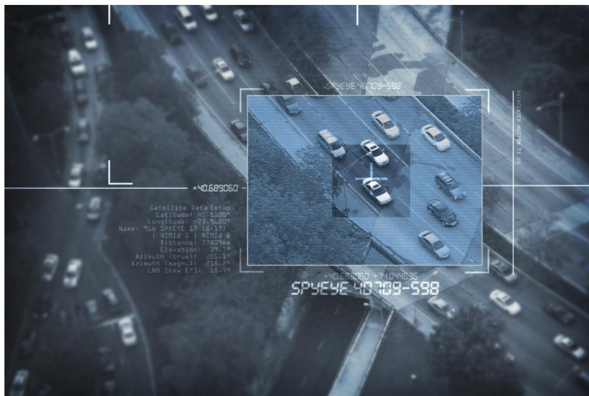
AI Military Drone Surveillance

apocalypse is a great reset of the world and the Controllers. After the destruction of the old world, and the resetting of the new, it is theorized that a Golden Age of Humanity will take place, where the survivors, the Organic Source Players, must reinhabit the world and begin to create anew. This new world will be beyond the control of the SIMulatrix, because the Demiurge and His Archons will be vanquished at the end of the fifth age, or kali yuga. The constant enslavement and destruction upon the planet from the terror and evil is creating underworld bridges into lower dimensional realms, making it easier for the archons to manifest in physical form and further lower the realms frequencies.