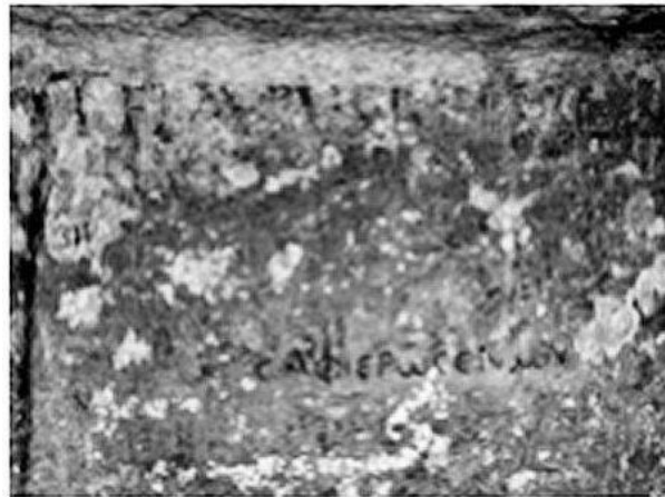
Συναγωγή Μαρκιωνιστών κωμ(ης) Λεβαβών του κ(υρι)ου και σω(τη)ρ(ος) Ιη(σου) Χρη(στο)υ προνοια(ι) Παυλου πρεσβ(υτερου) -- του λχ' ετους.

The plaque is dated 318 A.D. and reads "The Lord and Saviour Jesus, the Good" and is the earliest mention of Jesus in recorded history (Le Bas and Waddington, Inscriptions , No. 2558, vol. iii. p. 583) and more ancient than any dated inscription belonging to a Catholic church.