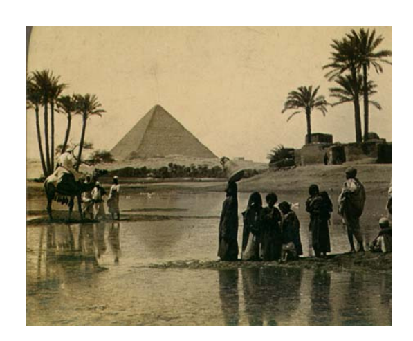
As the Great Pyramid of Giza (pictured above) well illustrates, everything is stable, durable and massive in Egyptian architecture.

Everything is stable, durable and massive in this architecture because it has to do with being eternal. If the Egyptians were the only people of antiquity that were known to us, we would truly be able to say, in fact, that art is the most faithful expression of the soul of the race that has created it.