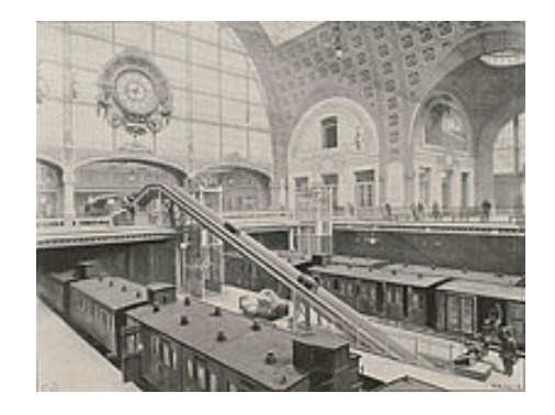
The utilitarian architecture of the train station in Paris corresponds well to the needs and ideas of our present-day civilization.

What has been said of painting is applicable to our architecture today that has been reduced to being imitations of architectural forms corresponding to needs and beliefs that we no longer possess. The only sincere architecture these days, because it is the only one that corresponds to the needs and ideas of our civilization, is that of the 5-story house, a viaduct, and a railroad station. This utilitarian art is just as characteristic of an era as formerly was the Gothic church and feudal castle, and for the archeologist of the future the large hotels of today and the Gothic churches will present an equal interest, because they will constitute successive pages in the books of stone that each age leaves behind, whereas he will disregard like useless documents the poor counterfeits which make up all modern art.