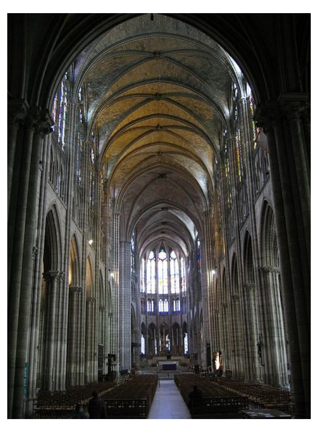
An example of the outstanding Gothic architecture of the semi-barbaric Middle Ages is the Basilica of St. Denis (located near Paris, France).

It seems therefore that the period of personality in the arts among a people is a blooming of its childhood or youth, and not of its mature age; and if one takes into consideration that, with the utilitarian preoccupations of the new society whose dawn we just now are able to see, the role of the arts is hardly marked, we are able to foresee the day where they will be classified as, if not inferior, at least secondary manifestations of a civilization.