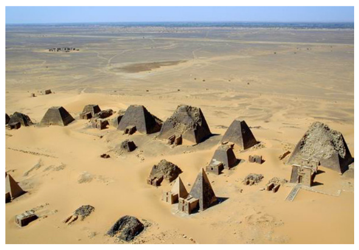
The pyramids of Meroe, built from 720 to 300 B.C., clearly reveal themselves to be inferior copies of the Egyptian pyramids.

I shall first take up the case of the most inferior of the peoples that I cited—the Ethiopians. We know that at a very late era of Egyptian history (24th dynasty), the peoples of Sudan, profiting from the anarchy and decadence of Egypt, seized some of its provinces and established a kingdom which had as its capital Napata and Meroe respectively, and which maintained its independence for many centuries. Dazzled by the civilization of the vanquished, they tried to copy their monuments and their arts; but these copies, of which we possess numerous specimens, are most often only coarse, rough shapes. These negroes were barbarians, and their cerebral inferiority condemned them to never being able to emerge from barbarity; in spite of the civilizing action of the Egyptians that continued for a long period of time, the Ethiopians, in fact, were never able to outgrow their primitive nature. Indeed, there is no example in ancient or modern history where a black population has been able to elevate itself to a certain level of civilization; and all the times whenever through one of these historical accidents, which in antiquity was produced in Ethiopia, and in our day in Haiti, an advanced civilization falls into the hands of negro races, this civilization has been rapidly brought back down to miserably lower forms.4