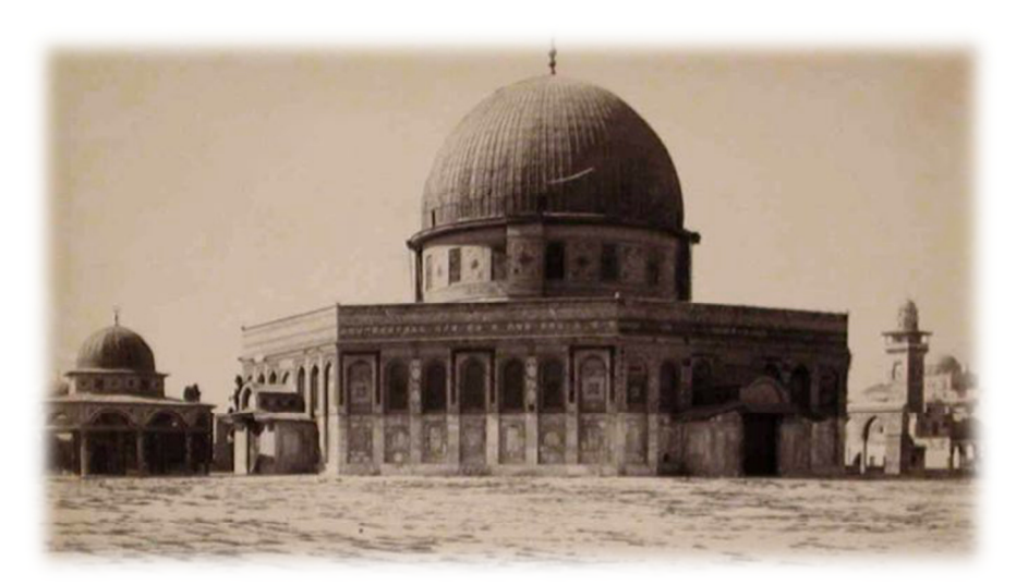
Mosque of Omar in Jerusalem (viewed from the north) The Byzantine architectural style, which the Arabs adopted at first, is clearly displayed here.