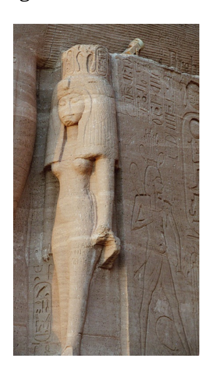
Statue of Nefert-Ari (Abu Simbel Temple in southern Egypt)

Let us first consider the Egyptians. With them their literature was always very deficient and their painting was quite mediocre, yet on the contrary their architecture and statuary produced masterpieces. Their monuments still elicit our admiration. The statues that they have left us, such as the Scribe, Nefert-Ari, Rahotep, and many others are still today exemplary models of art, and it was for only a very short period that the Greeks were successful in surpassing them.