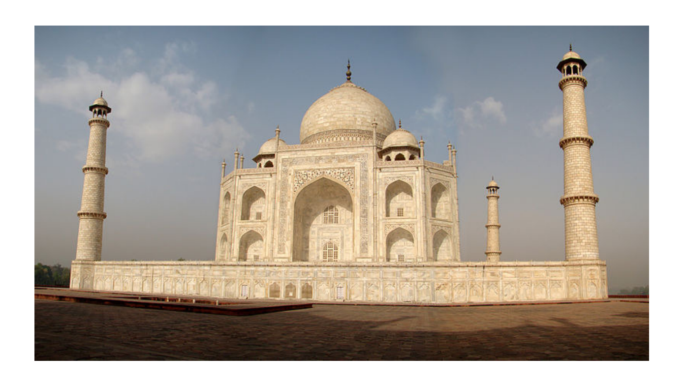
Taj Mahal, viewed from the East

The monuments that the Moguls erected in India, such as the Taj Mahal, are considered by many to be the most splendid monuments ever built; and yet no one would dream of classifying the Moguls among the superior races.