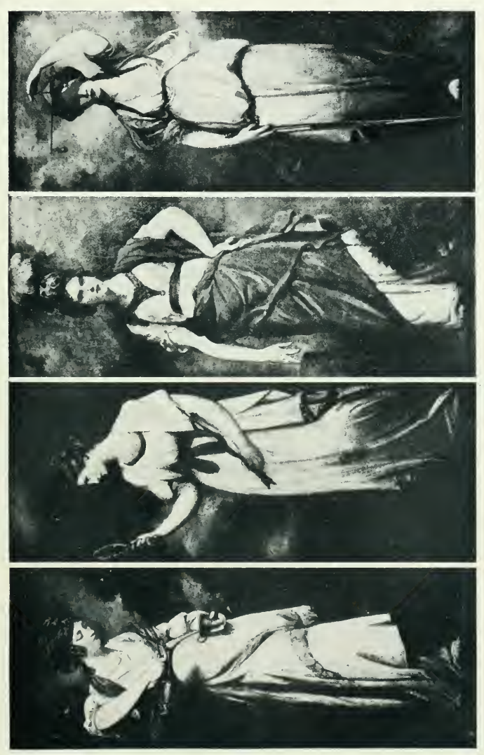
TEMPERANCE, FORTITUDE, PRUDENCE, AND JUSTICE