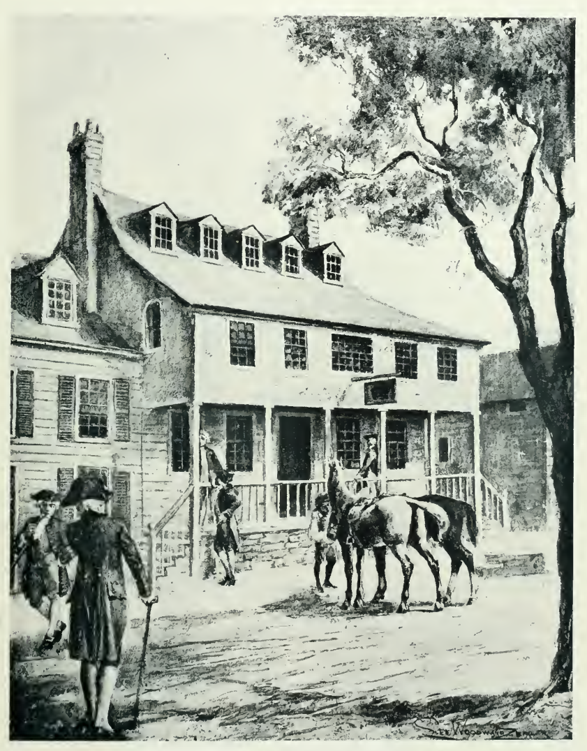
THE OLD TUN TAVERN, PHILADELPHIA The earliest known meeting place of Freemasons in Pennsylvania