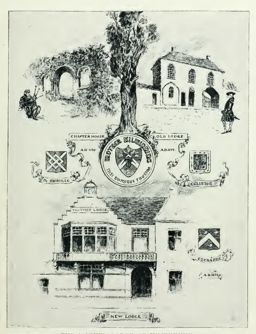
THE MOTHER LODGE OF KILWINNING