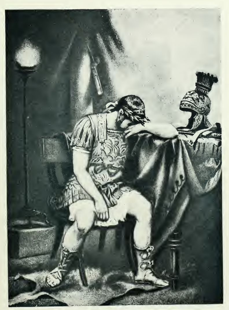
DREAM OF CONSTANTINE