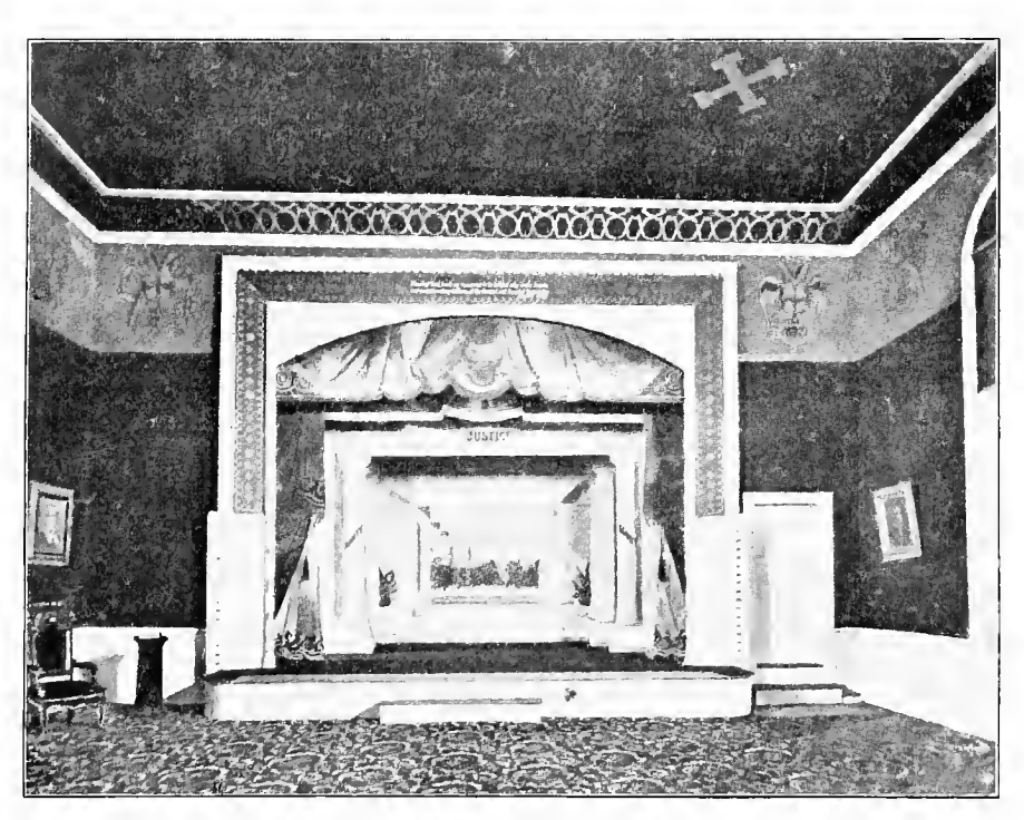
INTERIOR OF ALBERT PIKE SCOTTISH RITE CATHEDRAL, LITTLE ROCK.