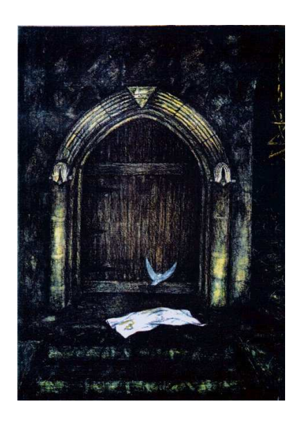
AGIOS O VINDEX!

Embodied art thou, you have burned your cross. You have dragged yourself up from the excrement That was your life and now on your black wings you (opfer). So go forth, dark messiah. The world is yours. Destroy and create.