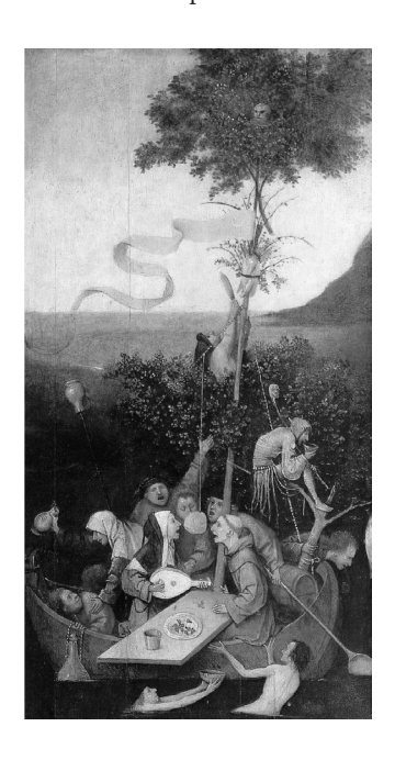
Fig. 1. Hieronymus Bosch, Ship of Fools (1490–1500)