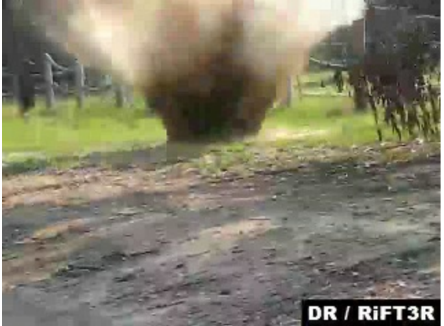
A frame from the 130 gram APAN detonation video. I was just out of frame to the left when it exploded.

My hearing returned to normal after around 24 hours. Andrew G. told me that he overheard people on the street talking about hearing the explosion from the 130 grams of APAN, which was approximately the same amount of high explosives as is found in a hand grenade. He also said, "I have no idea what I would have done if you got blown up." Later the same boys and I blew up a sheet of brass with nitroglycerine and exploded some acetone peroxide, but these were smaller devices than the 130g of APAN.