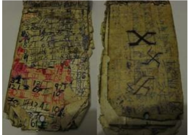
I found the score table from the card game "Sheep Head Sixty Six". On the back are swastikas I drew when I was 6 or 7.