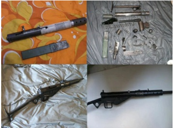
A few photos taken during the assembly of the Sten gun. I have many others.