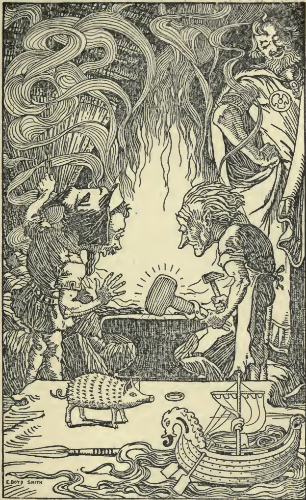
THE THIRD GIFT — AN ENORMOUS HAMMER