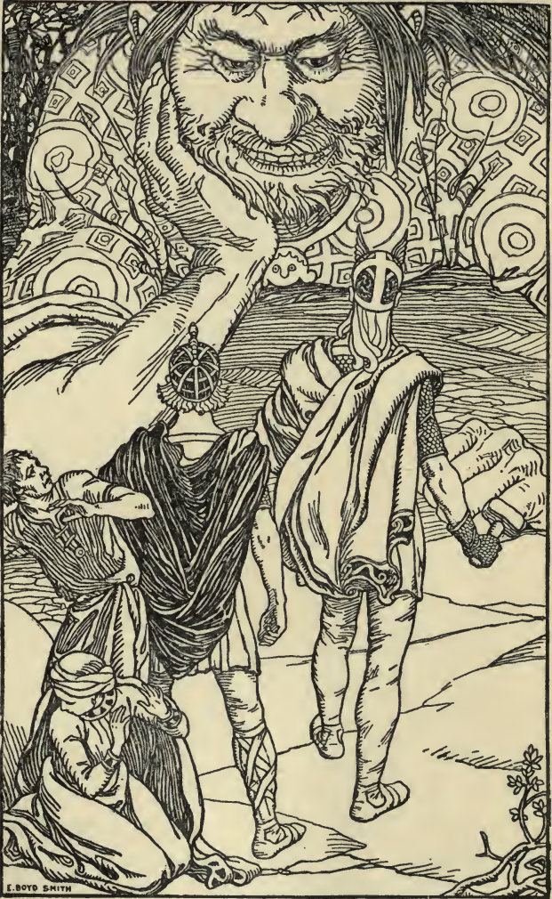
"I AM THE GIANT SKRYMIR" (page 150)