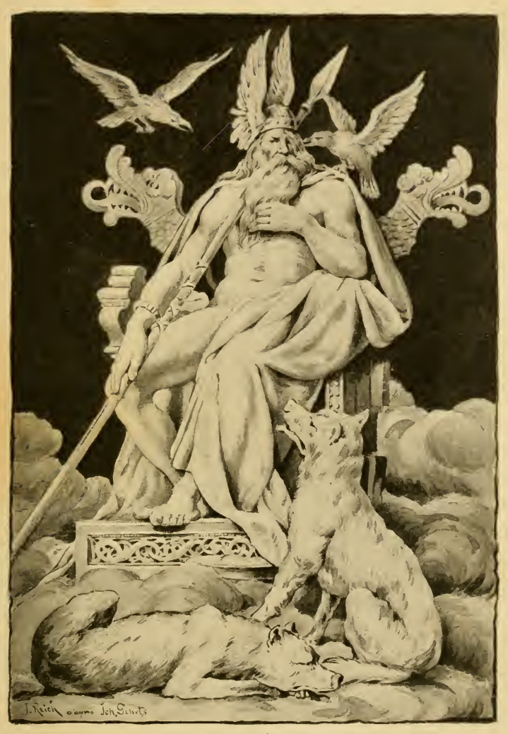
Odin on his Lofty Throne.