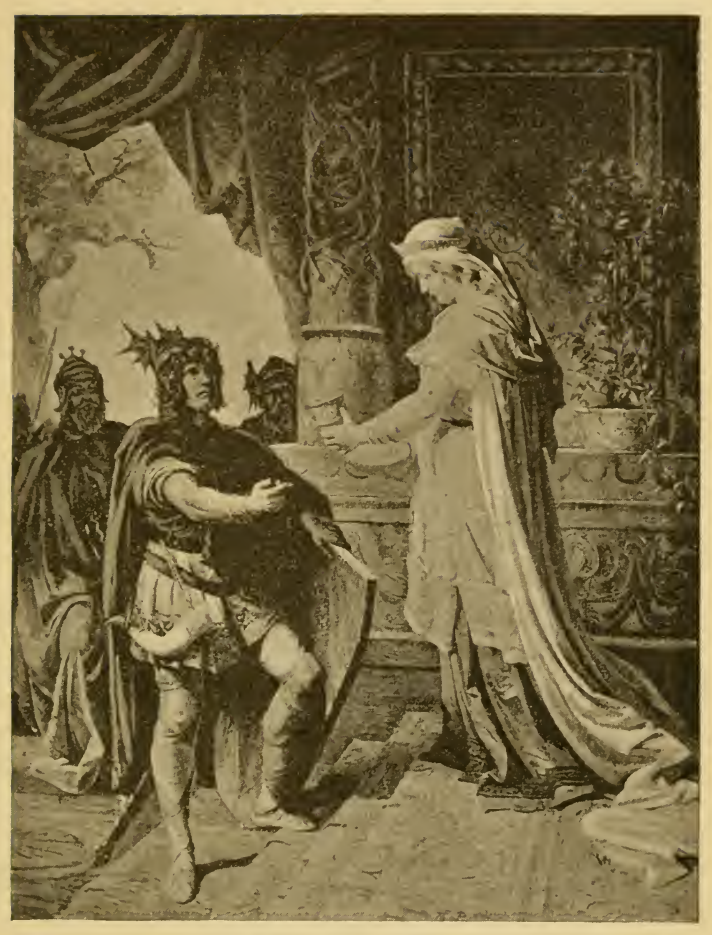
Grimhild Giving the Magic Cup.