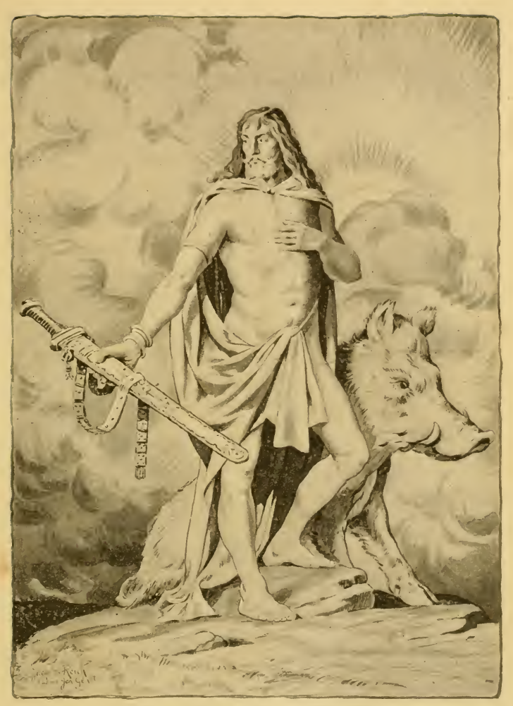
Frey and his Steed, Golden-bristle.