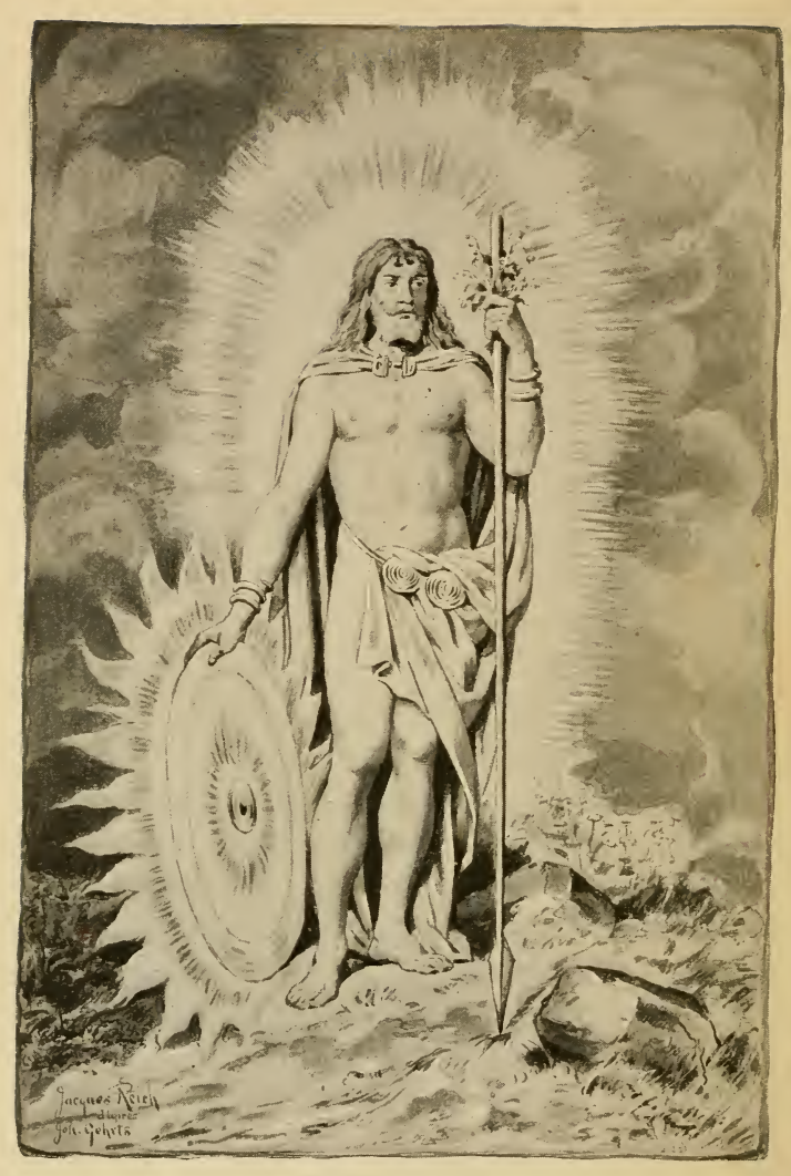
Balder the Good.