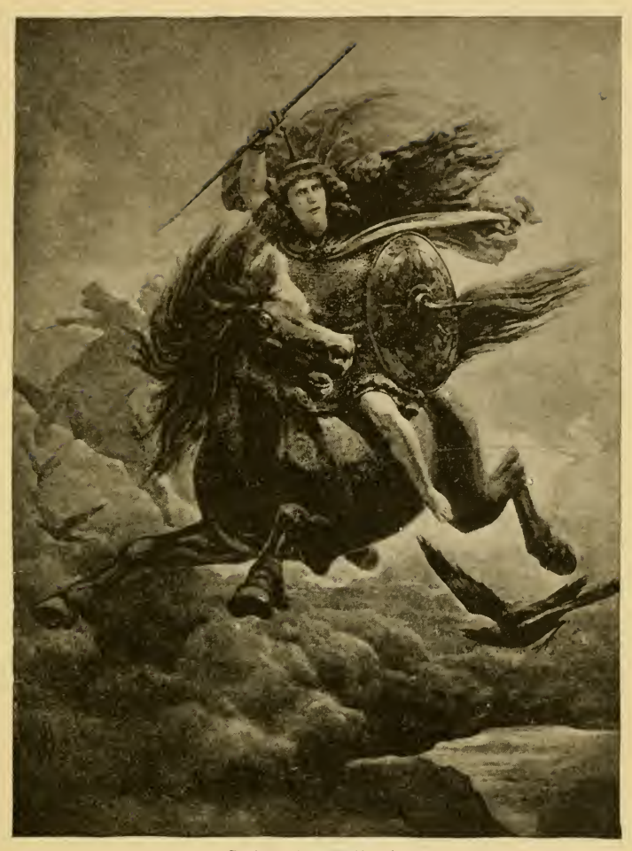
Gudrun the Valkyrie.