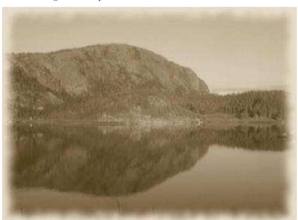
Figure 5.1. A photo of Helheim—Fosnes—Reflection in the water