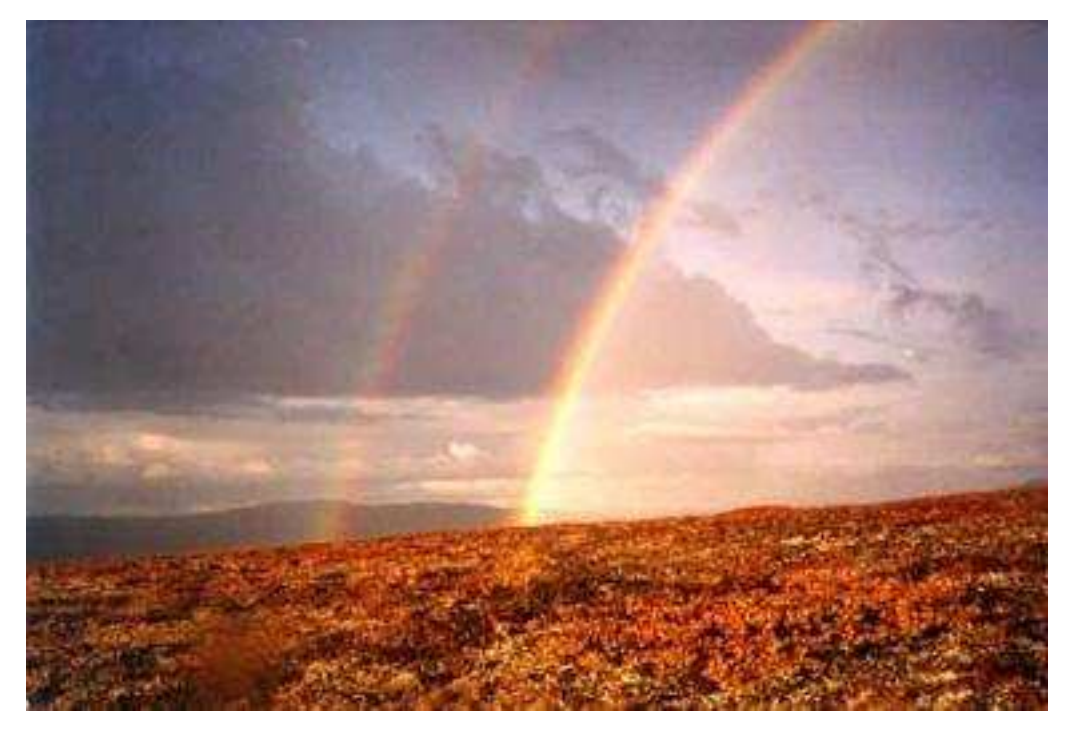
Figure 4.2. Himinbjörg—to the far North

were, and in many places still are, Halloween and Yule, and the period of time in between the two holidays was considered to be an especially dangerous time for being outdoors at night. Because of the reciprocity between the middle- and underworlds (see Chapt. 4), the best time for travel for the inhabitants of the underworld would have been at night in the winter (in middleworld terms) because in the Land Below it would be early summer during the day. The primary Day of the Dead for the Scandinavians was Yule-essentially Midsummer for the inhabitants of the Land of the Dead, and for the Celts it was Halloween or Samhain.