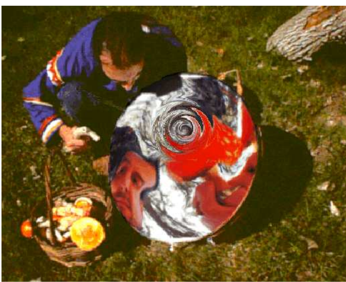
Figure 8.1. The seiðman with Fliegenpilze