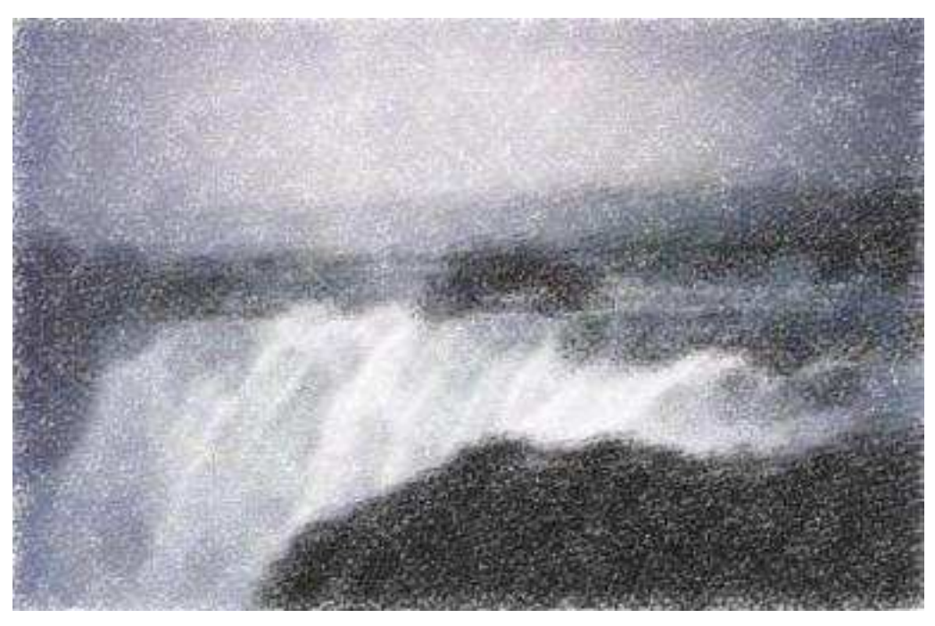
Figure 3.1. Goðafoss–Falls of the Gods

It makes good sense that the early settlers of Iceland would try to make peace with these beings because they knew that it was the only way to tap into the land's power/luck without which life in the new country was sure to be unsuccessful.