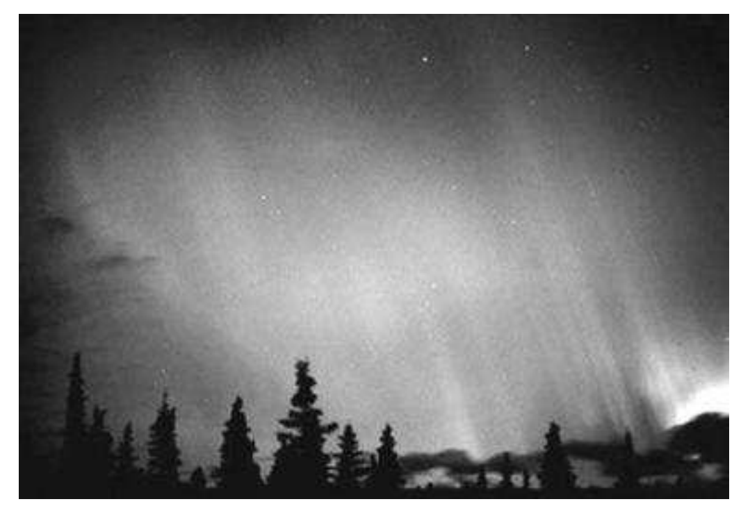
Figure 4.3. Aurora Borealis–Souls flying

time," a crack between this world and the Otherworld. Such "cracks" are common in Germanic folk medicine and folk magic, such as making magic on the sand at a point in between the levels of the tide or in a cave. <sup>24</sup> This concept continues to figure in modern native herbalism of northern Europe and will be discussed at length in later chapters.