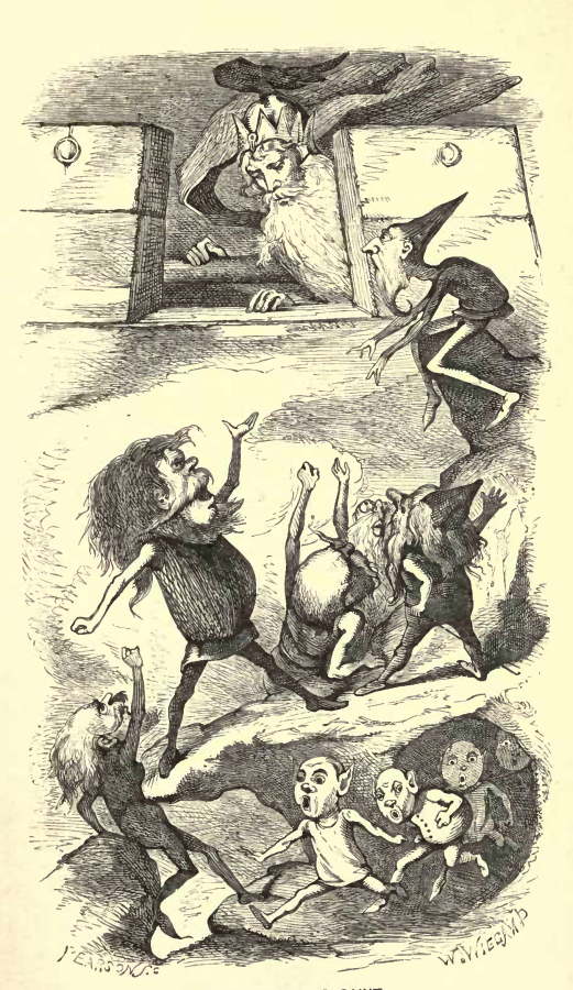
KING OLAF THE SAINT. 'Out came running the little elves' (p. 182).